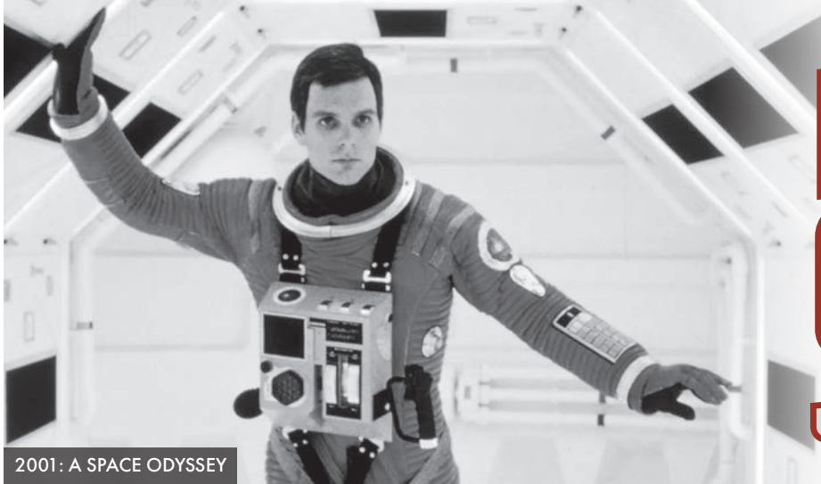
2001: A SPACE ODYSSEY