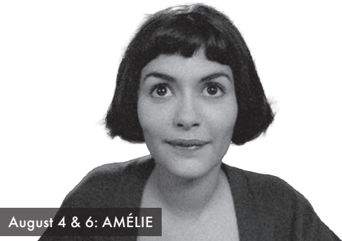
August 4 & 6: AMÉLIE