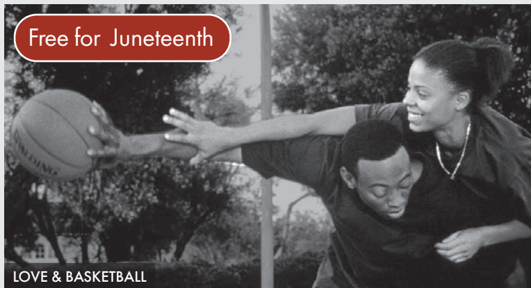
LOVE & BASKETBALL

Sanaa Lathan and Omar Epps star as basketball-obsessed next-door neighbors who find love over flirtatious pickup games, fall apart under the strain of high-pressure college hoops and families, and drift in and out of each other's lives as they pursue their twin aspirations of playing professionally. This program is supported in part by a grant from the Amherst Cultural Council, a local agency which is supported by the Mass Cultural Council, a state agency. This Juneteenth screening is free to the general public!