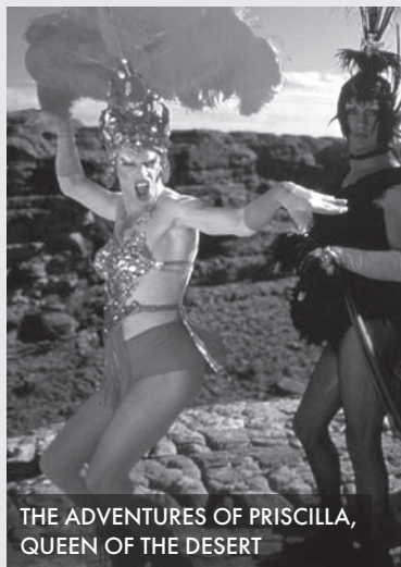
THE ADVENTURES OF PRISCILLA, QUEEN OF THE DESERT

Join us in June as we as we observe Pride Month and Juneteenth with films celebrating and centering queer joy and Black love.